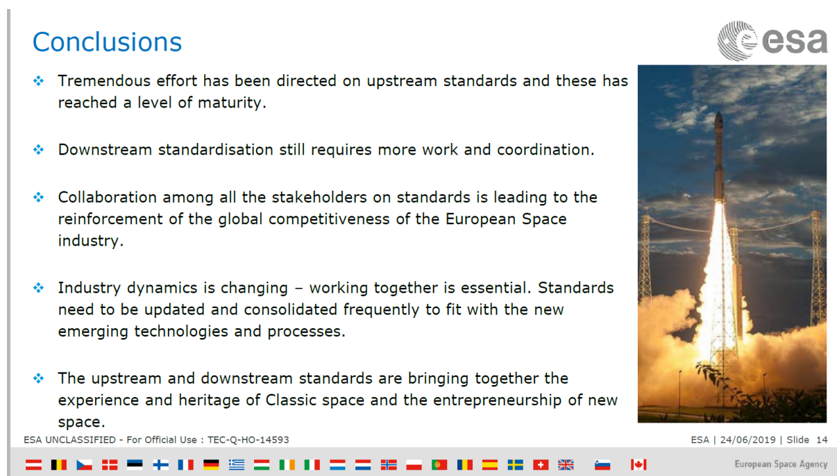
Figure 1. Conclusions